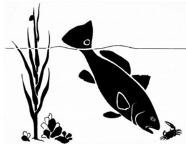
North Inlet-Winyah Bay National Estuarine Research Reserve