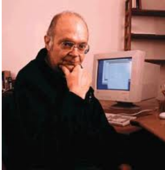
Figure 0.1 Donald Knuth, Creator of TeX

To set up a figure is only a bit more complicated than setting up a table, provided you have a figure handy. Figure 0.1 is an example.