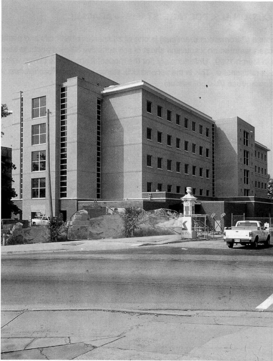
New home of the Peromyscus Genetic Stock Center. The Graduate Science Center under construction at the University of South Carolina.